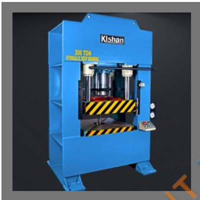
300 Ton Hydraulic Deep Drawing Press Machine