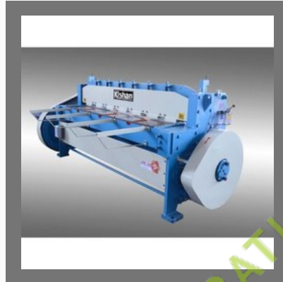
Mechanical Shearing Machine