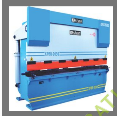
Hydraulic Press Brake Machine