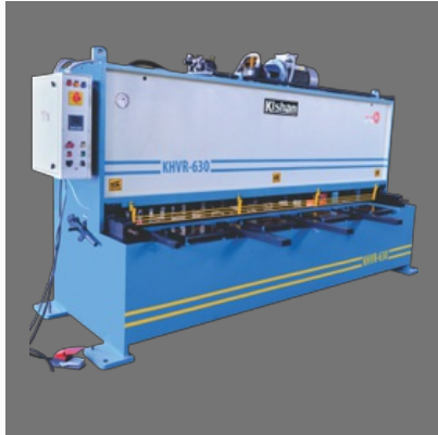
Hydraulic Angle Shearing Machine