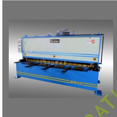
Hydraulic Plate Shearing Machine