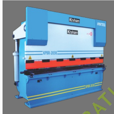
Sheet Metal Bending Machine