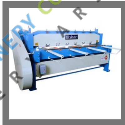
Mechanical Under Crank Shearing Machine