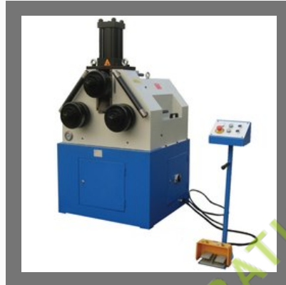
Hydraulic Section Bending Machine