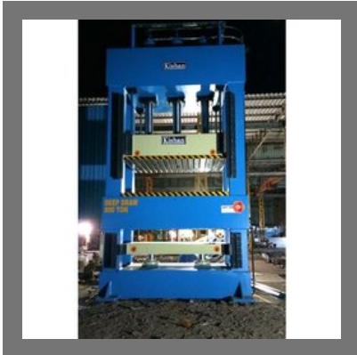
800 Ton Hydraulic Deep Drawing Press Machine