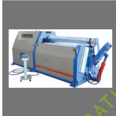
Hydraulic Plate Rolling Machine