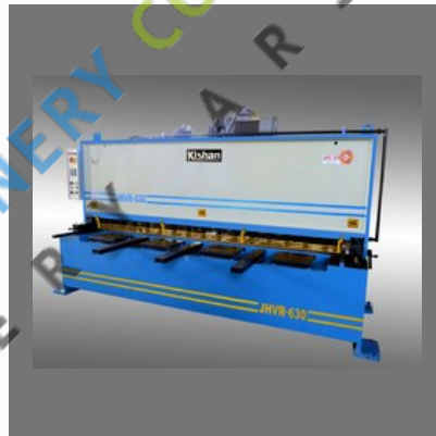
Metal Sheet Shearing Machine