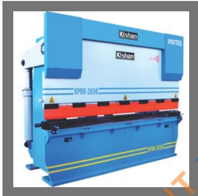
Press Brake Machine