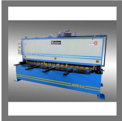
Hydraulic Sheet Shearing Machine