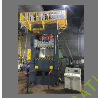
Heavy Duty Deep Draw Hydraulic Press