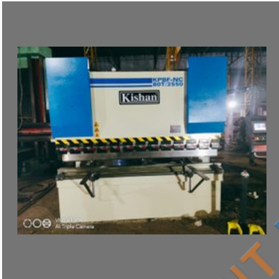
NC Hydraulic Press Brakes