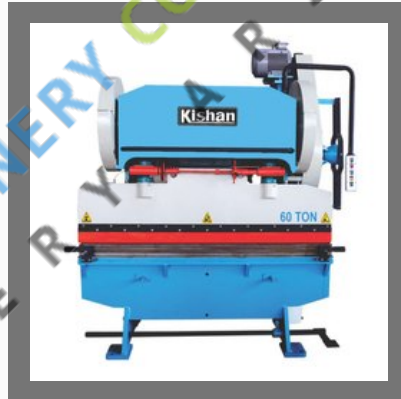
Mechanical Press Brake