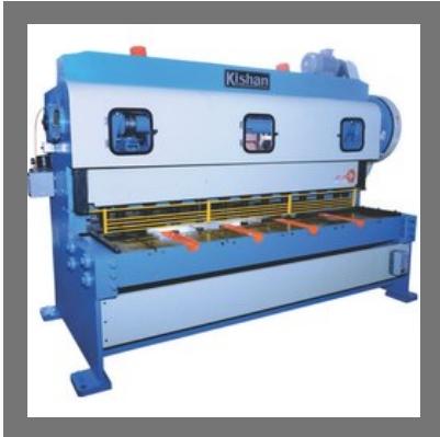
Mechanical Over Crank Shearing Machine