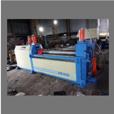
Sheet Rolling Machine