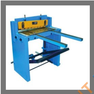
Treadle Shearing Machine