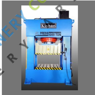
H Frame Hydraulic Press