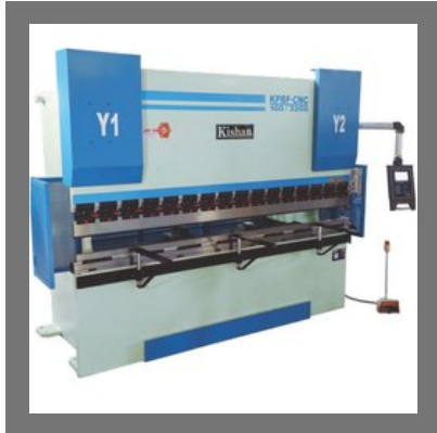
CNC Press Brake Machine