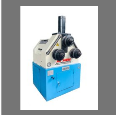
Hydraulic Profile Bending Machines