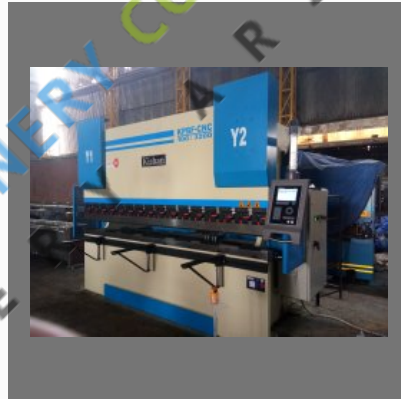
Hydraulic Bending Machine