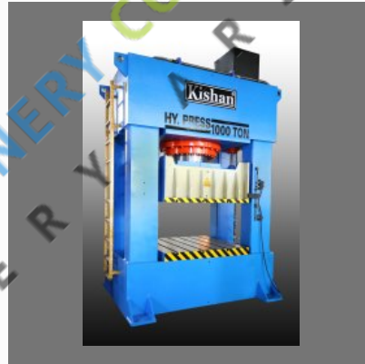
Heavy Duty Hydraulic Press