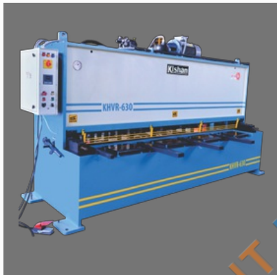
Plate Cutting Shearing Machines