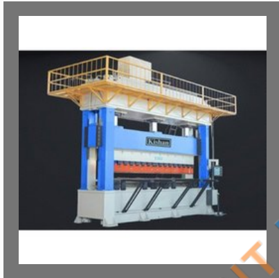
Heavy Duty Hydraulic Press